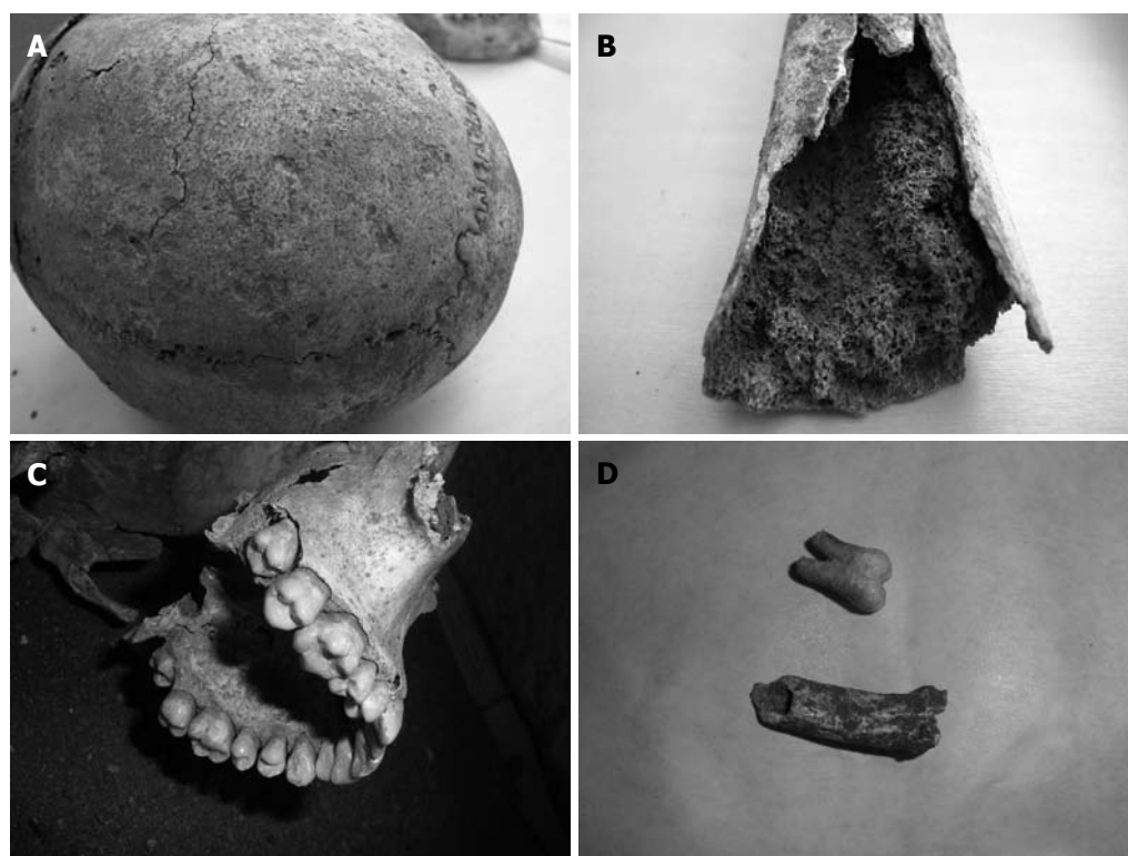
Figure 2 Research on the skeleton of the young girl. A: Skull vault showing excessive porosity; B: A particular of the femur showing cortical atrophy and spongio-sum bone hypertrophy, indirect sign of bone marrow hypertrophy, well preserved in 2000 years; C: A detail of teeth, showing basal dental enamel hypoplasia; D: DNA extraction: A tooth and a sample of bone from which DNA was extracted.