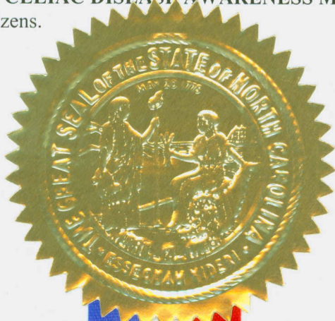
BEVERLY EAVES PERDUE

NOW, THEREFORE, I, BEVERLY EAVES PERDUE, Governor of the State of North Carolina, do hereby proclaim May 2010, "CELIAC DISEASE AWARENESS MONTH" in North Carolina and commend its observance to our citizens.