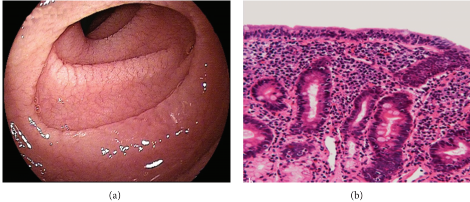
FIGURE 1: Endoscopic (a) and histologic (b) features found in RCD. Endoscopic abnormalities found in RCD include scalloped configuration of folds and fissuring with a mosaic pattern (a). Biopsies processed for histology show villous atrophy, crypt hyperplasia and increased infiltration of lymphoid cells in the epithelium (b).

CD3 expression (see Figure 2). In addition, this technique is able to identify other relevant cell populations such as \gamma\delta T cells or other “aberrant” IEL with preserved CD8 expression. This technique has been clinically validated and shown to be superior to t-cell receptor (TCR) clonality analysis in identifying patients at risk to develop an EATL [22].